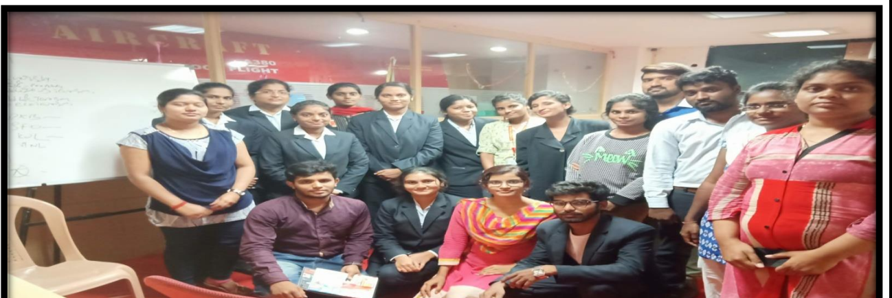
SELECTS OF UFLY INTERNATIONAL AVIATION