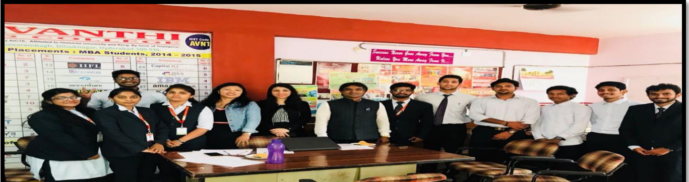
SELECTS OF CALVIN KLEIN