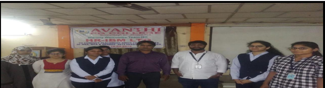
SELECTS OF IBM