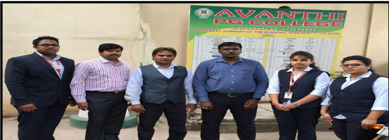
SELECTS OF KARVY