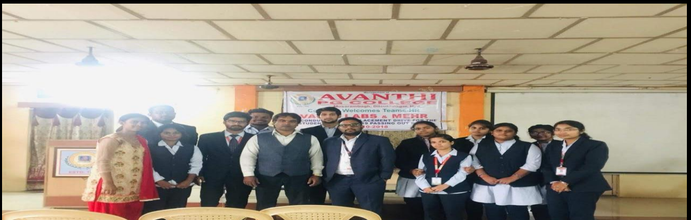
SELECTS OF VALUE LABS