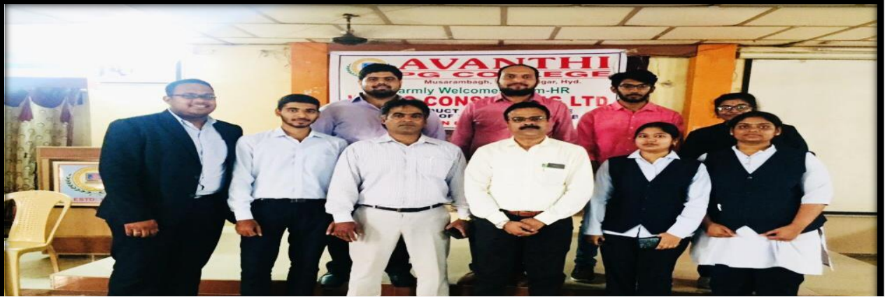
SELECTS OF WINFO CONSULTING