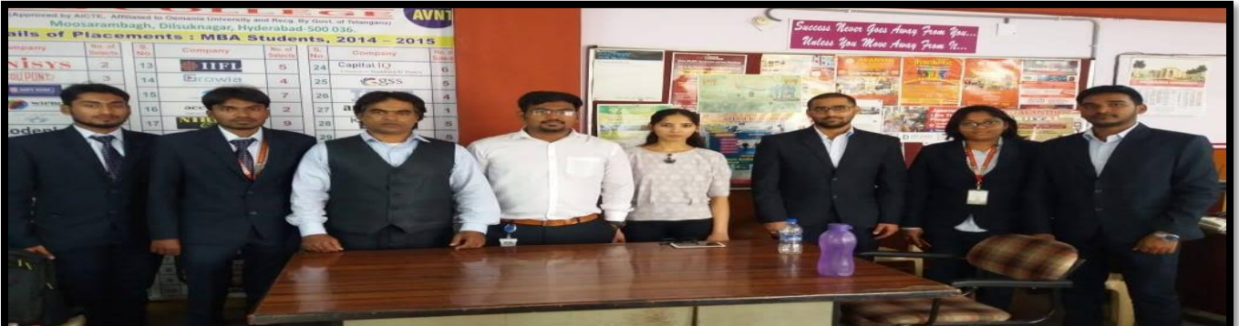
SELECTS OF NEXT EDUCATION